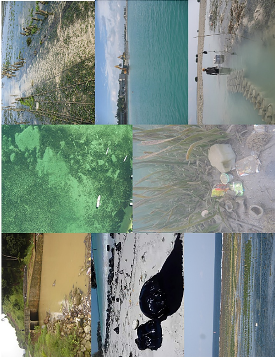
Plate 1. Threats to seagrass throughout the Indonesian archipelago. Clockwise from top left, sedimentation and poor water quality from deforestation (West Papua), boating impacts (Spermonde), seaweed farming (Rote Island), land reclamation (Pari Islands), sand mining (Pari Islands), garbage (Pali Bay), seaweed farming (Bali), oil pollution (Bintan).